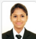
Lalita Kumari Leela Palace